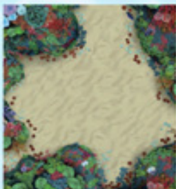
Coral Reef Stage

Even if you play for a long time, the gameplay is always fresh.