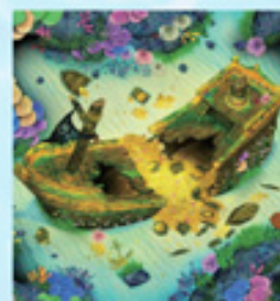
Sunken Ship Stage