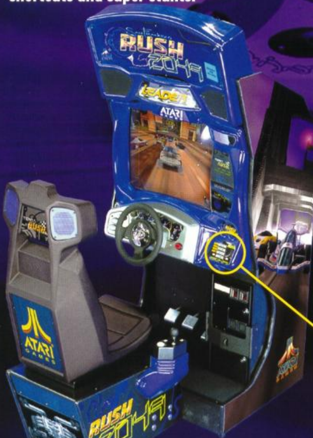
New two-piece cabinet with 27-inch UGA monitor, deluxe attraction marquee. Single units ship link-ready for a twin configuration. Link up to 8 units!

NEW PLAYER TRACKING SYSTEM: Rush 2049 has a 12-button keypad for player registration. By joining 'Team Rush' player's total mileage, best times and car preferences will be recorded in that Rush 2049 unit. Players can earn frequent driver awards like secret cars and tracks.