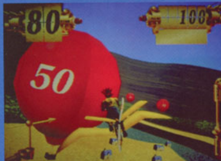
The unique design and course layout of each level demonstrates the versatility of Namco's graphics.