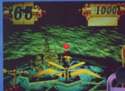
The advanced courses are more complex and require pilots to maneuver their aircraft with accuracy and at times speed.

Specifications: Dimensions: 93" x 50" x 106 1/2" Weight: 1,300 lbs. Power Consumption: 750 Watts