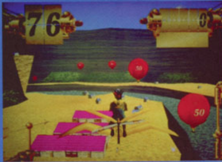
Amateur pilots can glide through the Novice course with little chance of becoming lost.