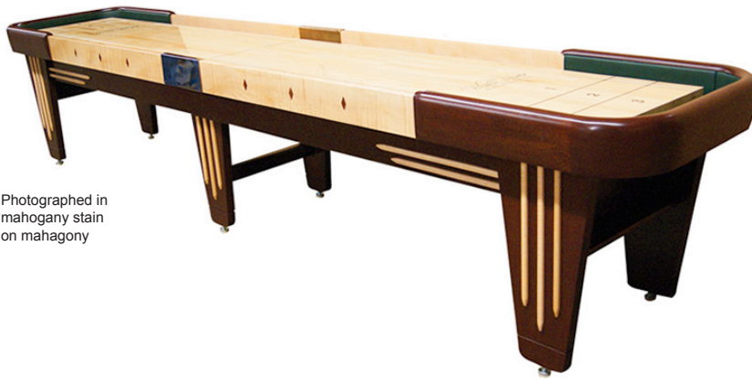
Photographed in mahogany stain on mahogany

WWW.VENTURESHUFFLEBOARD.COM - SALES@VENTURESHUFFLEBOARD.COM